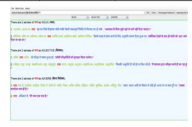
Fig. 2. Senses of the word 'पास' (paas)

As an example let's find the correct meaning of this sentence: 'मोहन के पास एक अच्छी कलम है।' (Mohan ke paas ek achchi kalam hai). In the given sentence 'पास' (paas), 'अच्छा' (achcha) and 'कलम' (kalam) contain multiple senses. The 7 different senses in Hindi WordNet for the word 'पास' (paas) are shown in Figure 2. If we link that 'पास' (paas) word with 'अच्छा' (achcha) and 'कलम' (kalam) word then there will be several senses for the sentence 'पास अच्छी कलम' (paas achchi kalam). The 14 different senses in Hindi WordNet for the word 'अच्छा' (achcha) are shown in Figure 3 and the 11 different senses of word 'कलम' (kalam) are shown in Figure 4. Lesk algorithm helps us in fetching the actual meaning of the word according to its usage. This reduces the number of