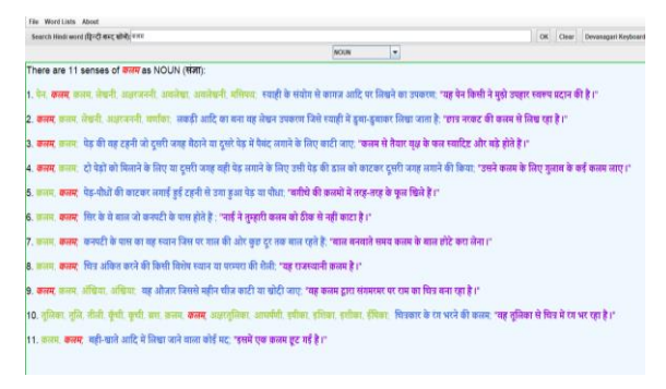
Fig. 4. Senses for the word 'कलम' (kalam)