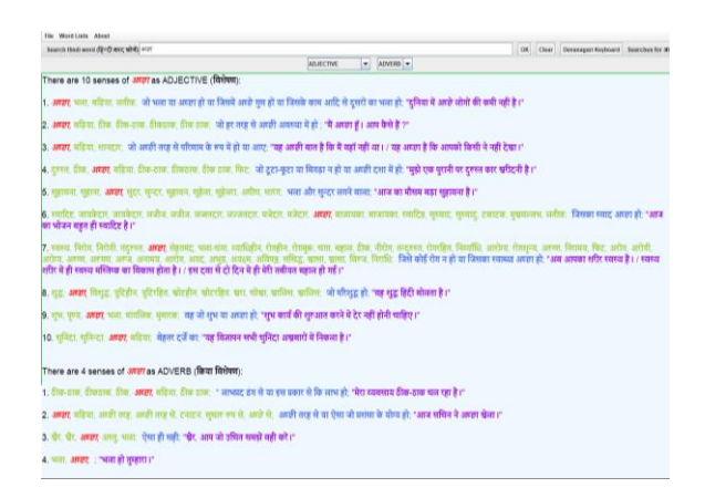
Fig. 3. Senses for the word 'প্রান্থ্যা' (achcha)

iterations required for WSD. According to Lesk algorithm, the best sense of 'पास' (paas) is 'अधिकार' (adhikaar), the best sense of 'अच्छा' (achcha) is 'सुंदर' (sundar), and the best sense of 'कलम' (kalam) is 'पेन' (pen). In such a process we are avoiding stop words such as का, के, की, है, हो, से, मे, ने (ka, ke, kee, hai, ho, se, me, ne) etc.